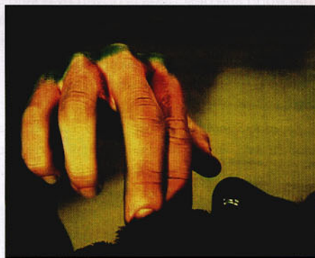
• La Cumbia 1999 Video stills

Bruce Nauman's film Art Make-up No. 3 Green (1967–8), for instance, or troubling classics such as Yves Klein's blue print nudes, Hermann Nitsch's blood-splattered volunteers or Joseph Beuys' very own honey and gold-leaf po-face ( How to Explain Pictures to a Dead Hare , 1965), to name just a few male, ritualistic, minstrel-like or mystically tinged acts – although there are probably enough other examples to cover the entire colour spectrum.